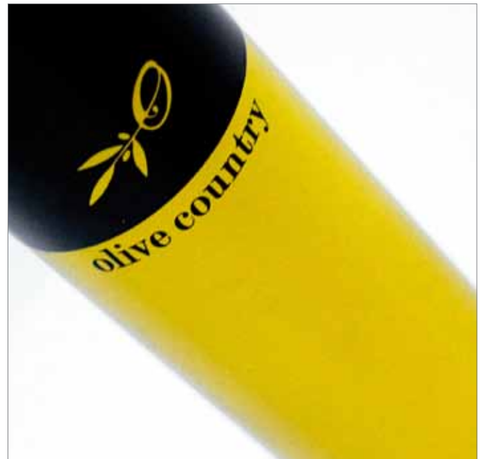
03. Packaging/Close Up